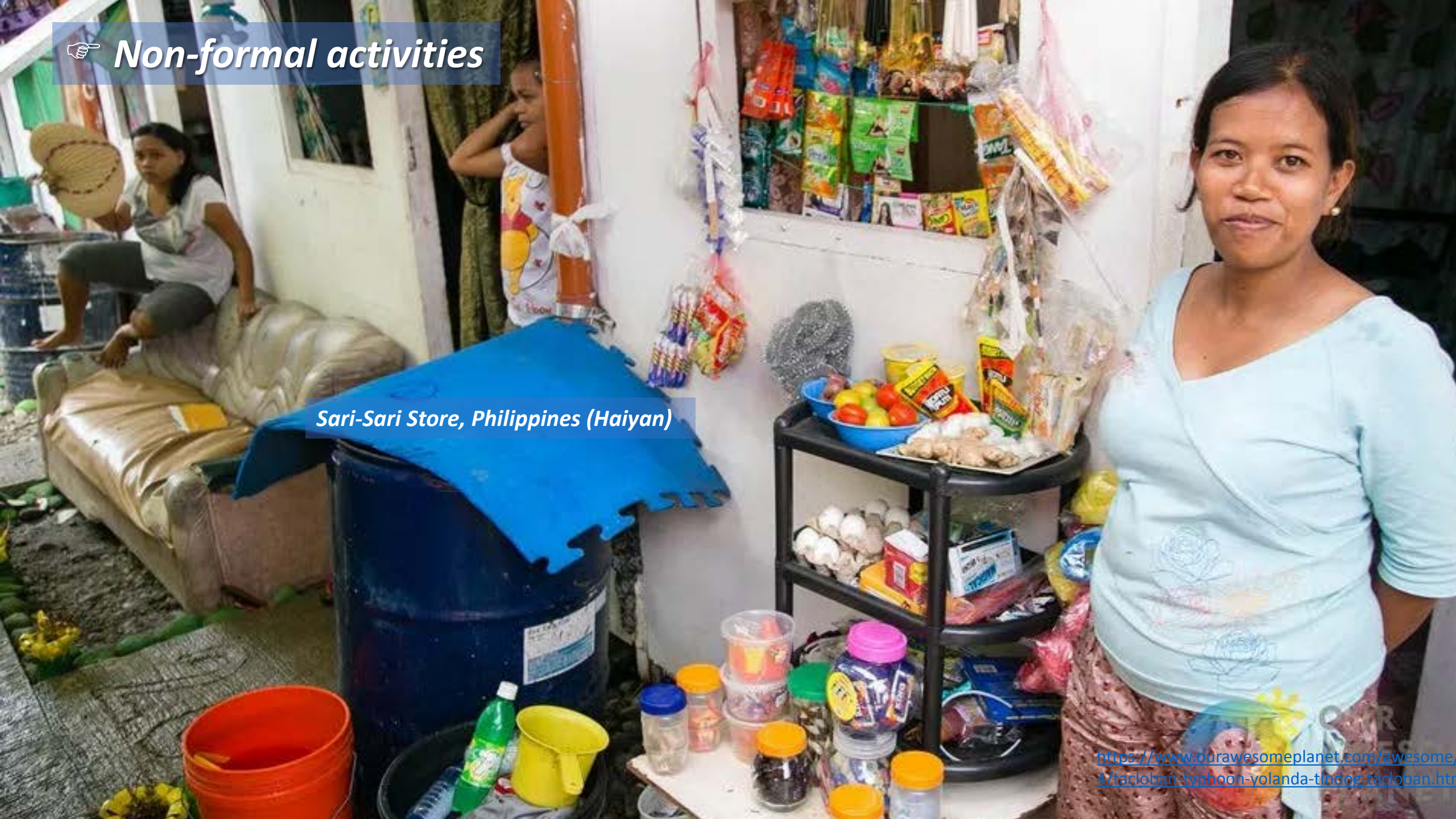
Sari-Sari Store, Philippines (Haiyan)