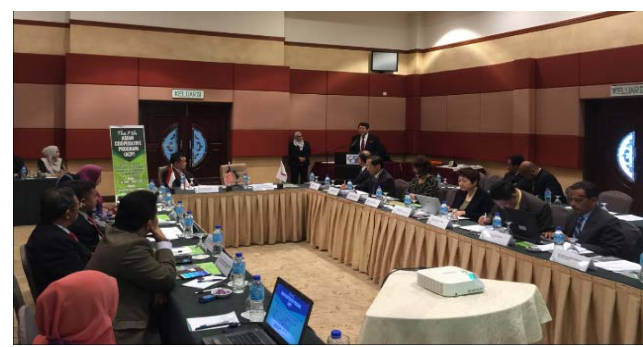
Discussion amongst university representatives at the fifth ACP Conference

At the sixth ACP Conference, KUIS, MSU, UUM, and UNILA are planning to sign an MOA to issue a joint certificate of the program.