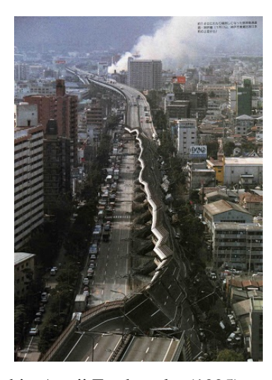
Great Hanshin-Awaji Earthquake (1995)