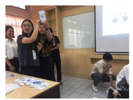
Prepare for Presentation

The next ACP International field study will be held in February 2020 at KUIS.