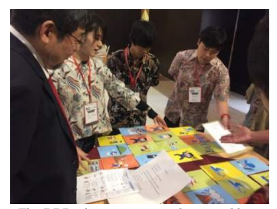
The DDR education materials created by a student group