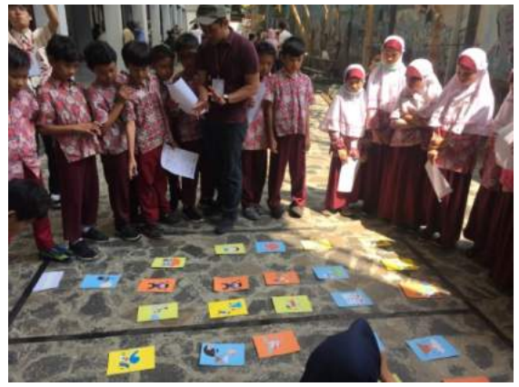
Card games for linking DDR to appropriate countermeasures