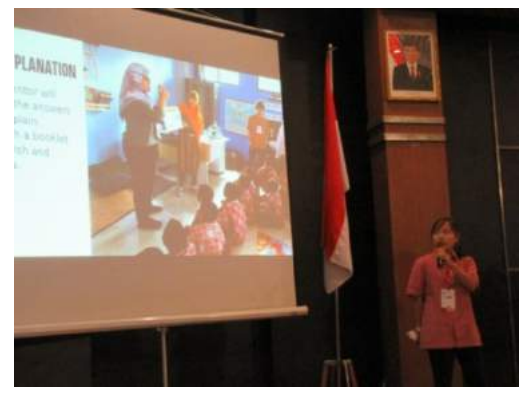
Student Presentation 2