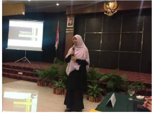
Welcoming address from UUM, will be the host of the 9th ACP Conference