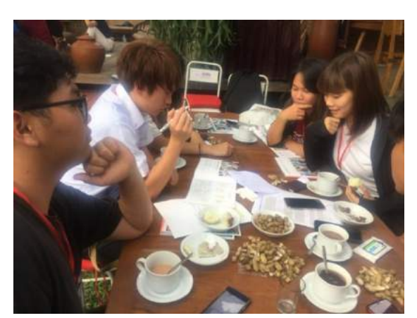
Groups develop DDR education materials