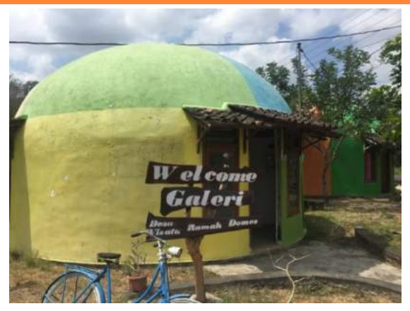
Dome house built as part of disaster reconstruction