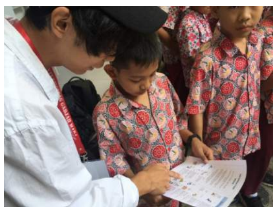
Explaining how to play the game