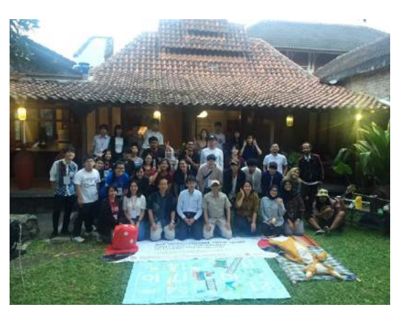
Prepare for DDR education materials

The survey revealed a number of challenges in the field, such as schooling and DDR education for children. Accordingly, the participating students were divided into five groups of mixed nationalities to work together in preparing materials to try and make learning about DDR fun, like "DDR playing cards" and "putting emergency goods in a bag." Next, the groups visited a local elementary school to provide DDR education to 100 fifth-grade children. The elementary school was very welcoming, and the groups helped to make the DDR learning process enjoyable for the students.