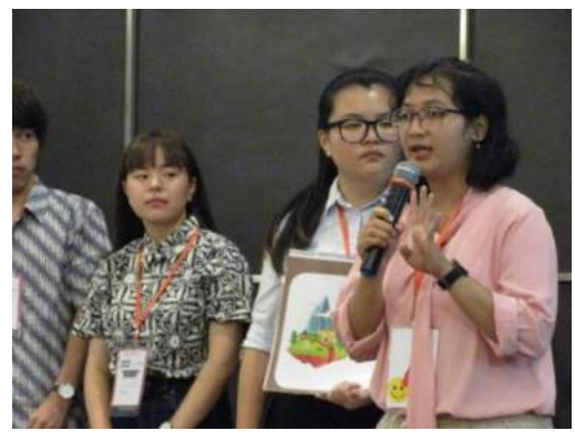
Student Presentation 1