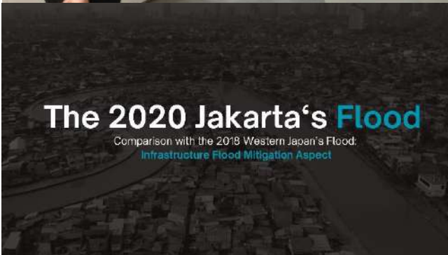
Final presentation by Group 3