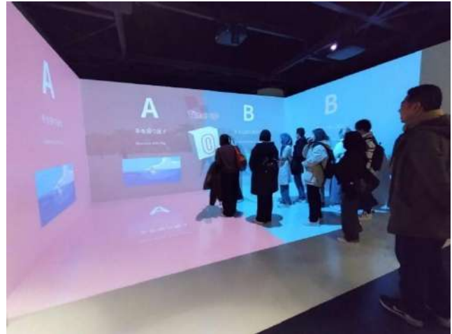
Field work at Disaster Reduction and Human Renovation