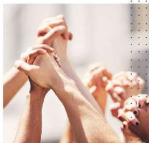
Final presentation by Group 1