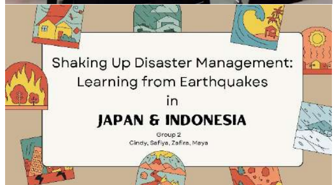
Final presentation by Group 2