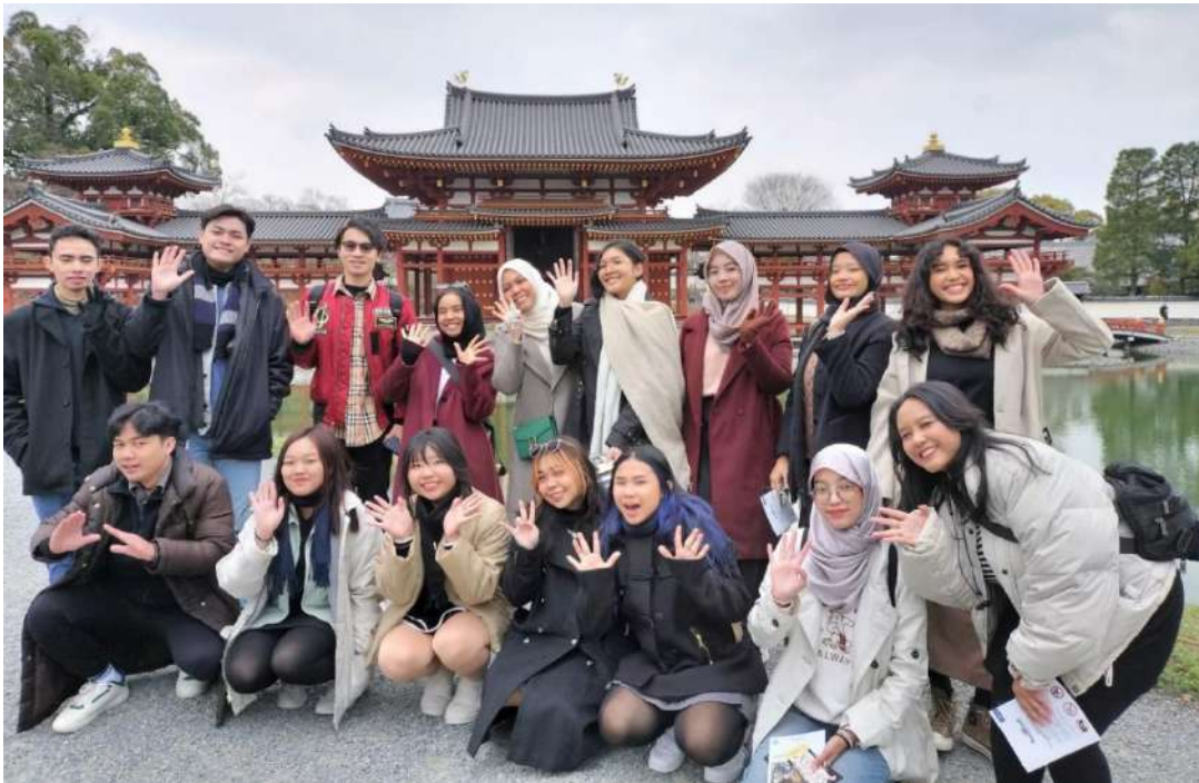
A Group photo at World Heritage "Byodoin," Kyoto

Kansai University of International Studies (KUISs) recently hosted the ACP International Field Study Program in Kobe, Japan, with the topic of "The Japanese Safety Management and Japanese Culture" Program. The ACP International Field Study Program has been continuously conducted by the ACP Consortium since 2016 with the aim of developing human resources capable of managing the development of a "safe and secure" Asia. This program in Kobe was the 20th anniversary of the ACP International Field Study Program.