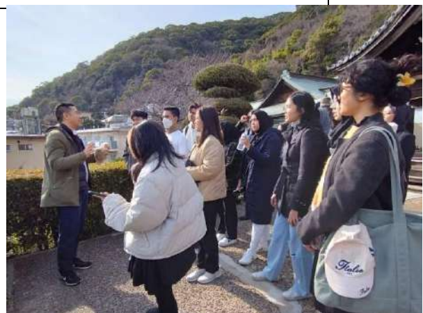
Field work in Kobe Kitano area

The program was designed to study the policy response in Japan at each stage of the crisis management cycle during a large-scale disaster: emergency response, recovery and reconstruction, and mitigation, with a focus on the 1995 Great Hanshin-Awaji Earthquake.