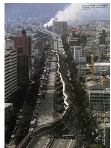
Great Hanshin-Awaji Earthquake (1995)