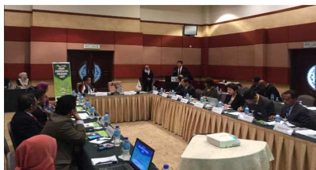
Discussion amongst university representatives at the fifth ACP Conference

At the sixth ACP Conference, KUIS, MSU, UUM, and UNILA are planning to sign an MOA to issue a joint certificate of the program.