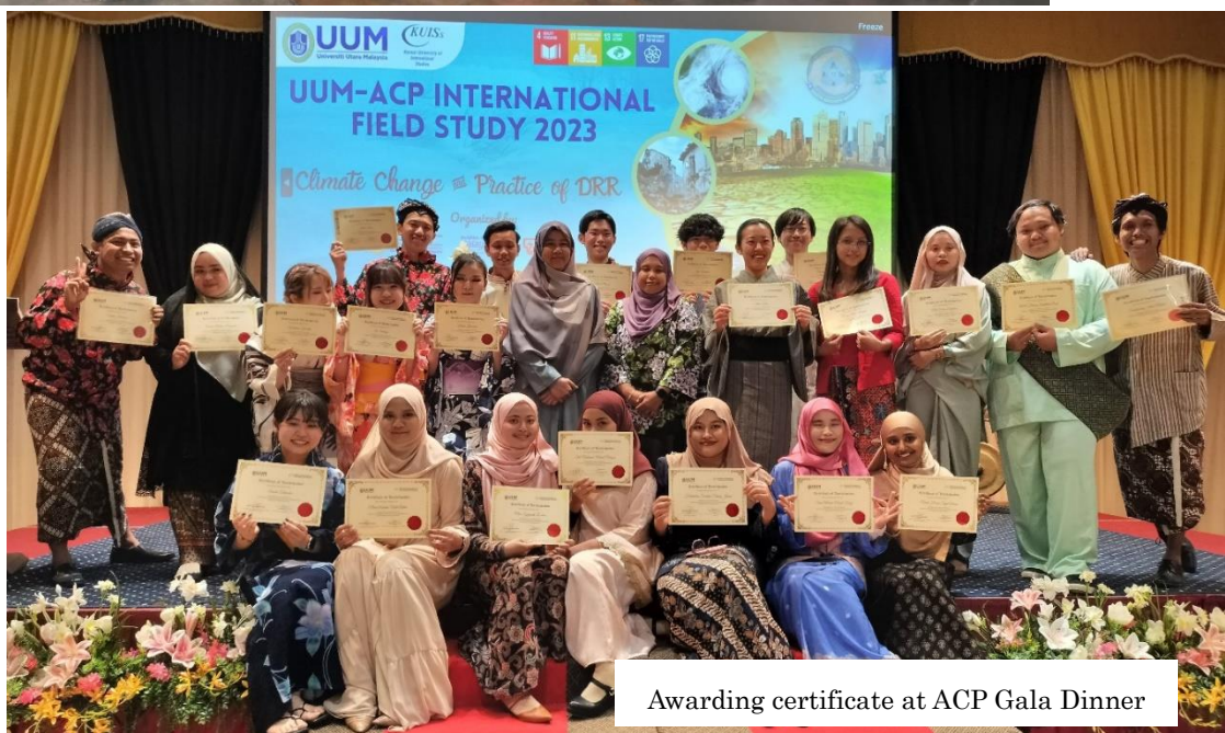
Awarding certificate at ACP Gala Dinner