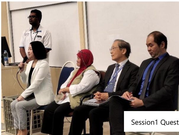
Session1 Questions and Answers