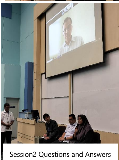
Session2 Questions and Answers