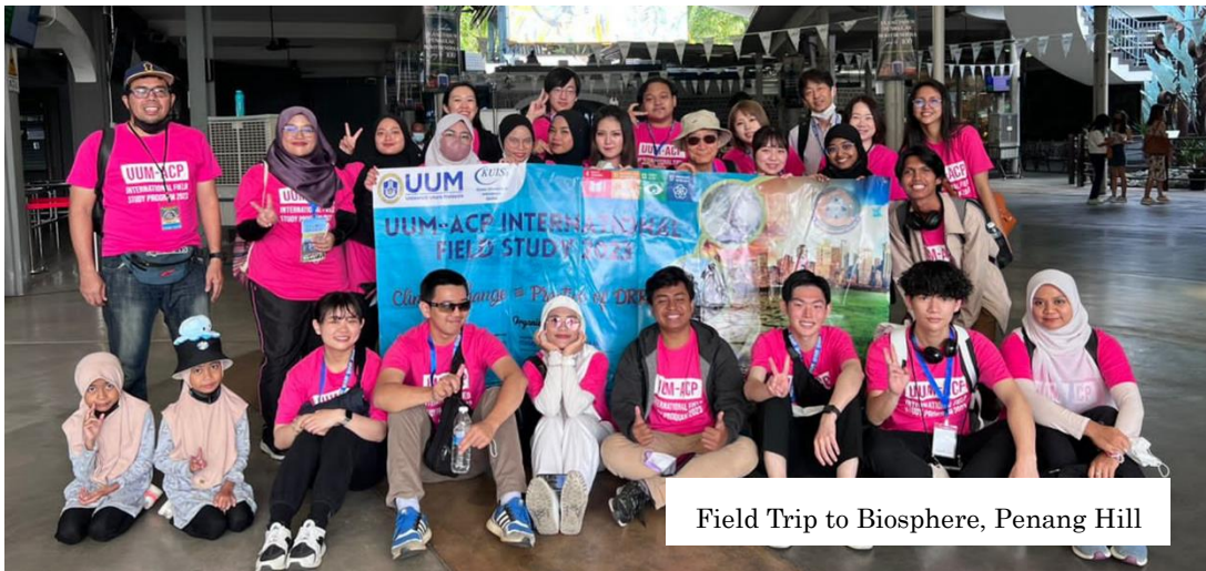
Field Trip to Biosphere, Penang Hill